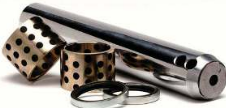
EMS chrome plated pins with brass bushing

Low maintenance Extended Maintenance Bushings (EMS) provide 1,000 hour/six month greasing intervals, greatly reducing daily and weekly maintenance for the operator. The bucket pins retain a 250 hour greasing interval. Fitted as standard, anti-friction shims in the boom foot and head reduce noise and cut free play.